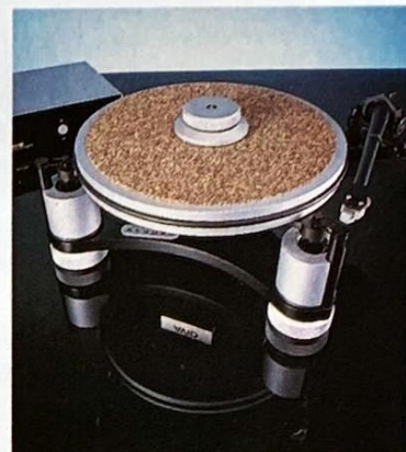
Each of the chassis' three legs can be levelled individually, and the cork-topped platter can be further fine-tuned via the springs in each leg.