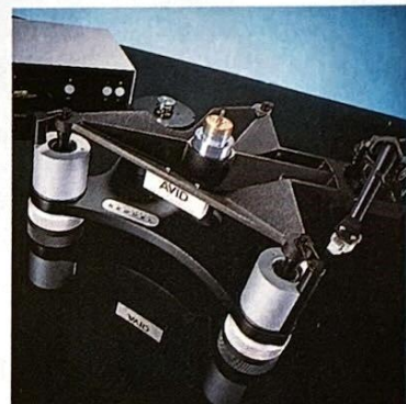
The Crouzet external power supply is basically the same as the one in Avid's £5,000 Acutus model, but in a stripped-down, unmodified form.